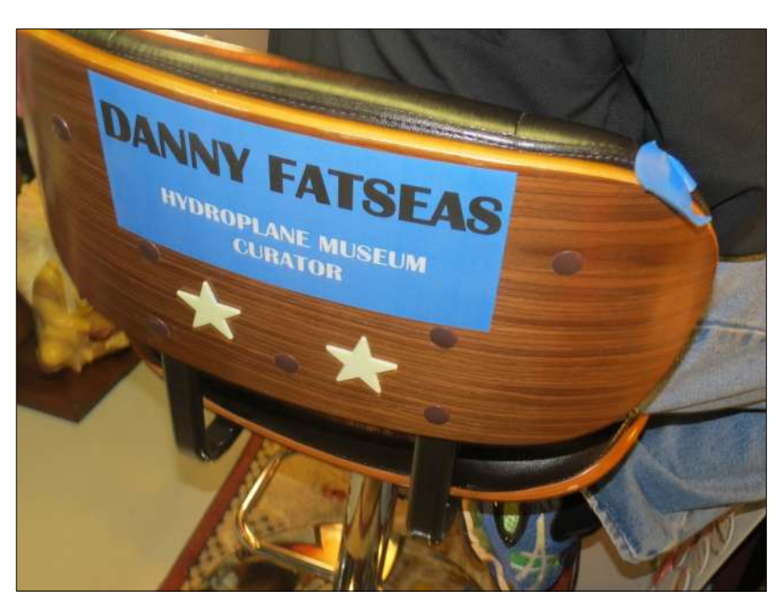
Just because . . .