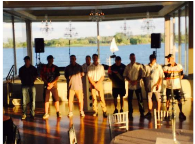
The 2016 Gold Cup Drivers